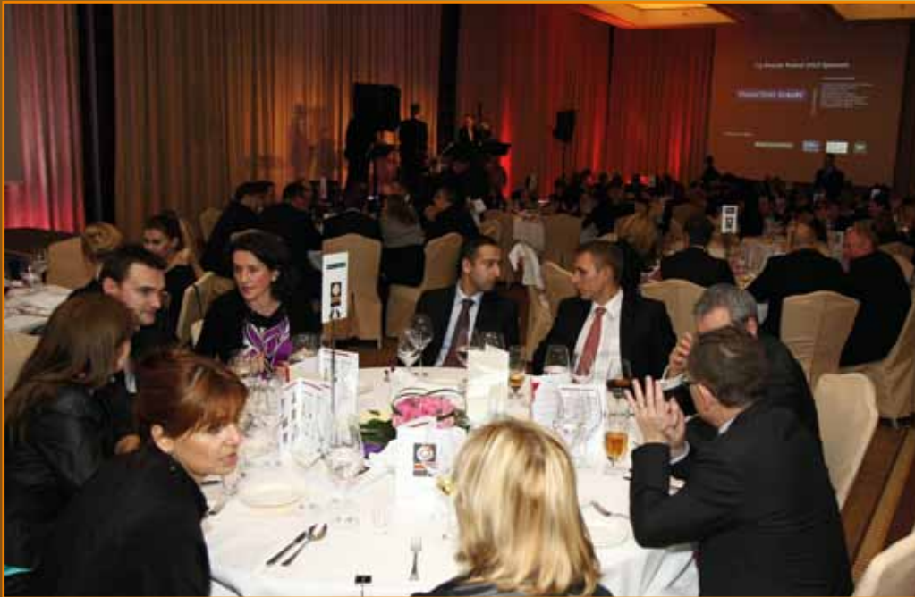
BZ WBK table